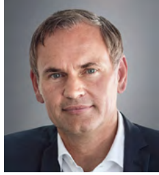
Oliver Blume Chairman of the Executive Board