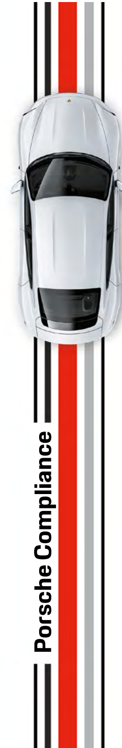
Photo Credits Cover: Porsche Page 4, 7, 8, 12, 15, 16, 19, 20, 23, 24, 27, 29, 31, 32, 36, 39, 41: Porsche Page 11: NASA Page 29: Hannah Busing on unsplash Page 35: Scott Graham on unsplash